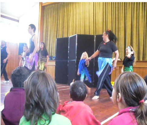
Whiu Whānau performing at the Matariki Hauora Day