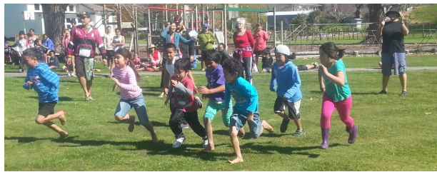
5-6 year olds taking off