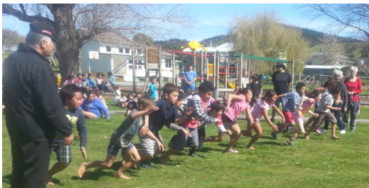
7-8 year olds