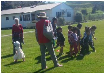
4-5 year olds getting ready to start their race