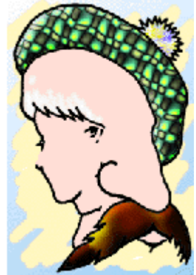
Whole family mind teaser - father with mother and daughter.