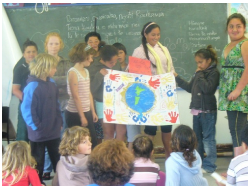
Room 1 sharing their appreciation of Whaea Apiti

Which dot is in the centre of the circle?