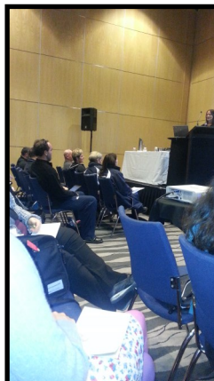
One of the many top quality seminars we attended